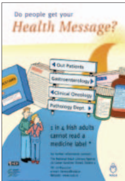
A poster from the Irish Health Literacy campaign