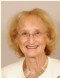
Baroness Sally Greengross OBE