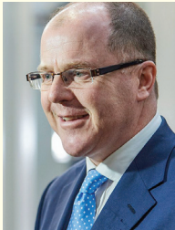
George Freeman MP