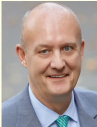
Professor Martin Green OBE

Sir Malcolm was the founding chairman of NHS England, where he served for seven years. He was previously Pro-Vice Chancellor of Cambridge, then President and Provost of UCL.