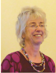
Baroness Ruth Lister CBE

Baroness Lister has been a peer since 2011. She is Emeritus Professor of Social Policy at Loughborough University and a former Director of the Child Poverty Action Group and now its Honorary President.