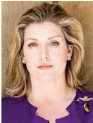
Penny Mordaunt MP